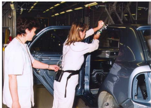
Ergonomic measurement on the Fabia assembly line